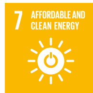
Use green electricity