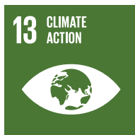
Protect the climate